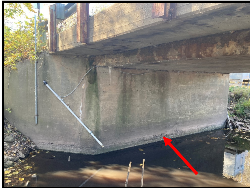
Scouring has deteriorated the base of the abutments.