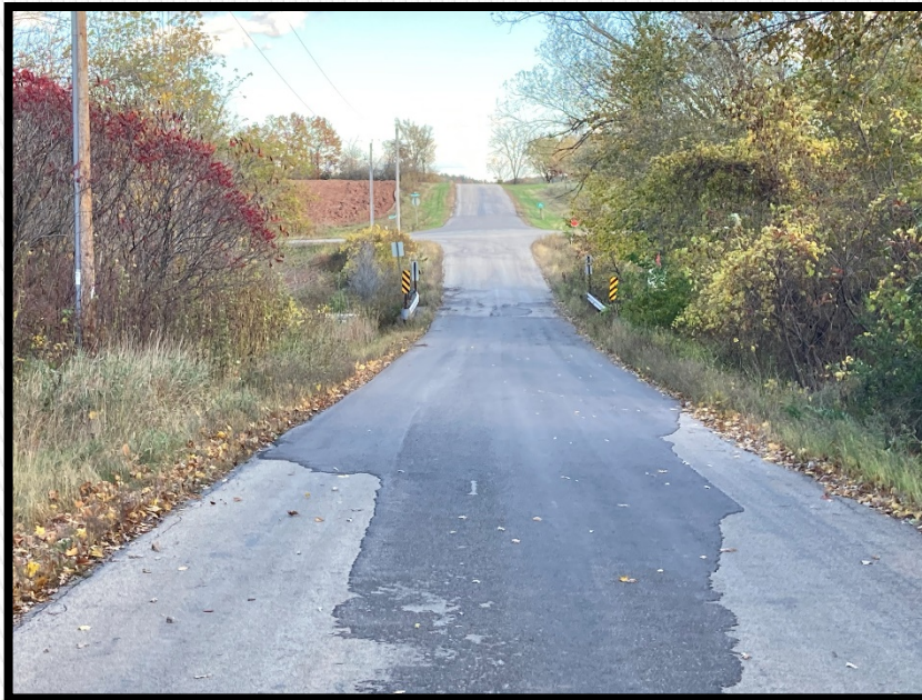
Deck has been patched and overlaid with asphalt (looking east)