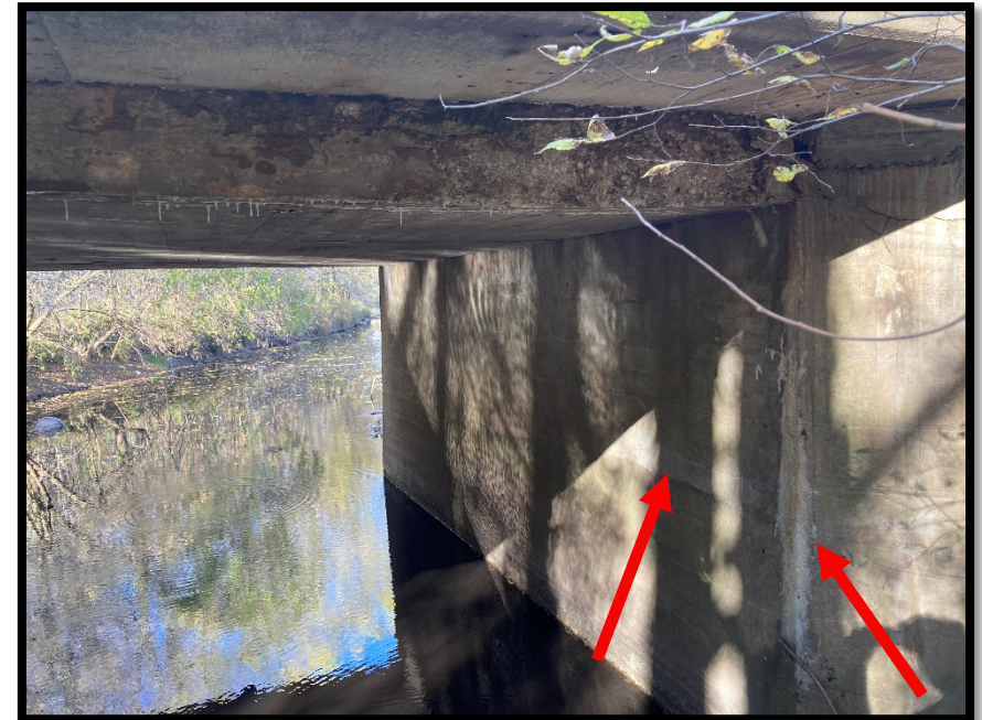
Efflorescence on east concrete abutments