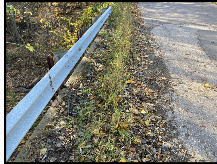
Exposed gravel (spalling) and vegetative build-up along north and south deck edges