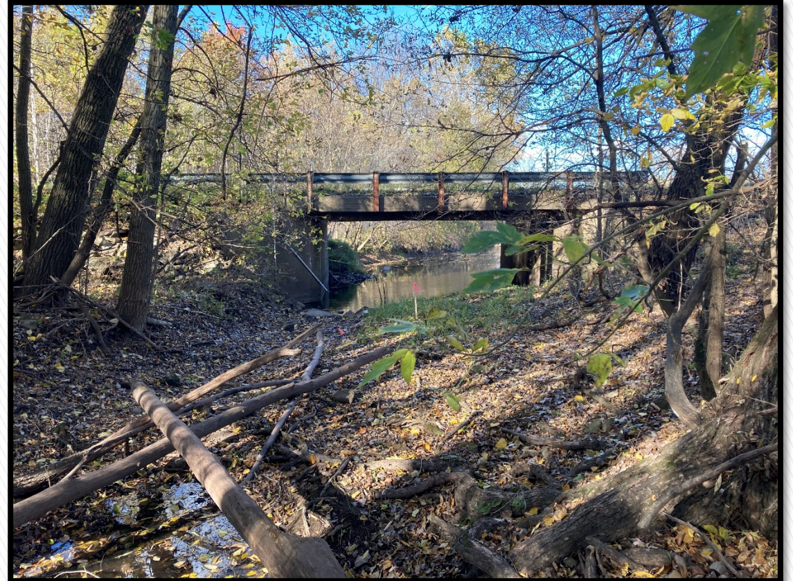
View of the current Branch of Plum Creek Bridge, looking north.